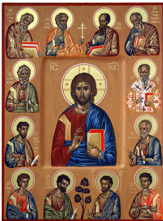
'Synaxis of the Twelve Apostles Icon'

The Scripture readings for today teach us of God's majesty and humility. The Lord thunders to Job out of the whirlwind, and speaks of God's sovereignty over creation and events, even when life does not make sense to us. In the letter to the Hebrews, Jesus' perfect humility is described. Through his faithful obedience and love, Jesus left his glory in heaven to sacrifice himself and pay the ransom price for our sins. In Mark, Jesus rebukes the presumption of James and John, and the squabbling of the other disciples. He reminds them and us that while earthly power lords it over others, the way of God's Kingdom is giving our lives in humble service. Like the disciples, we think "we are able," but the way of the Cross teaches that it is only God who is able.