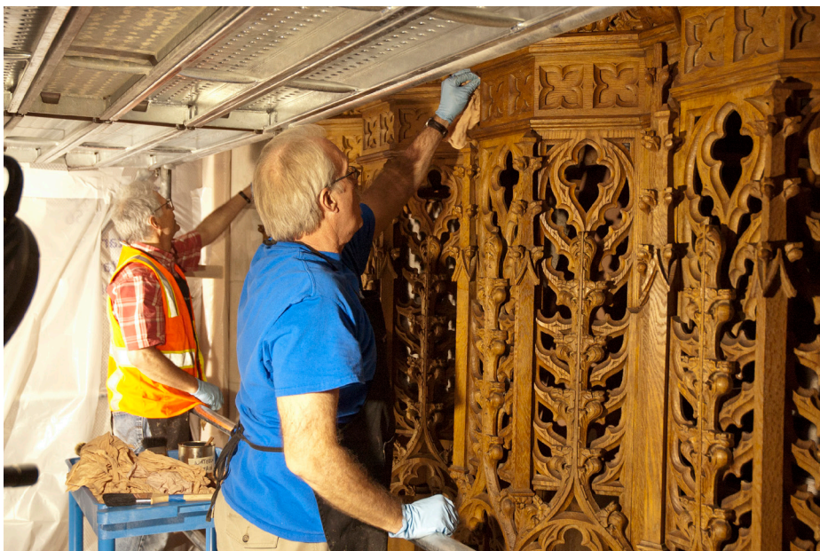
Restoring Woodwork inside Duke University Chapel.

Please continue to pray for the Chapel and all those working on its restoration.