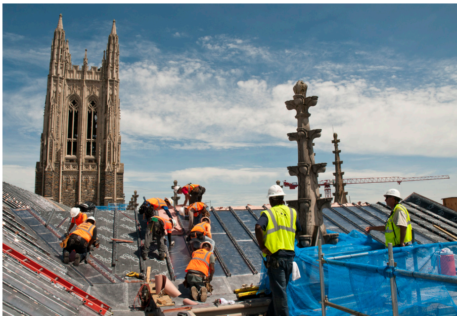
Crews work to remove and replace lead-coated copper roofing panels. Please continue to pray for the Chapel and all those working on its restoration.

We invite you to consider joining the Congregation at Duke Chapel. The Congregation is an interdenominational church with a variety of vibrant ministries, including discipleship and spiritual formation (for children, youth, and adults), mission and outreach, and pastoral care. Please email congregation@duke.edu or call 919-684-3917 for information.