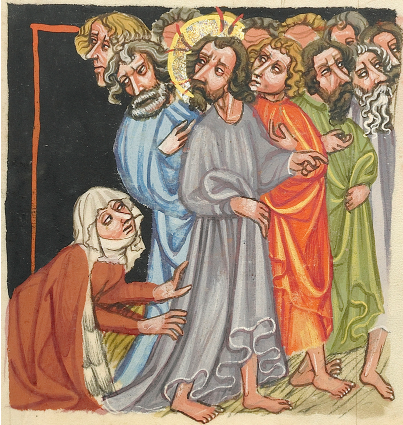
Manuscript illumination, Healing of a Woman with an Issue of Blood , c. 1400–1410

SERVICE OF WORSHIP Sixth Sunday after Pentecost Sunday, June 30, 2024, 11:00 a.m.