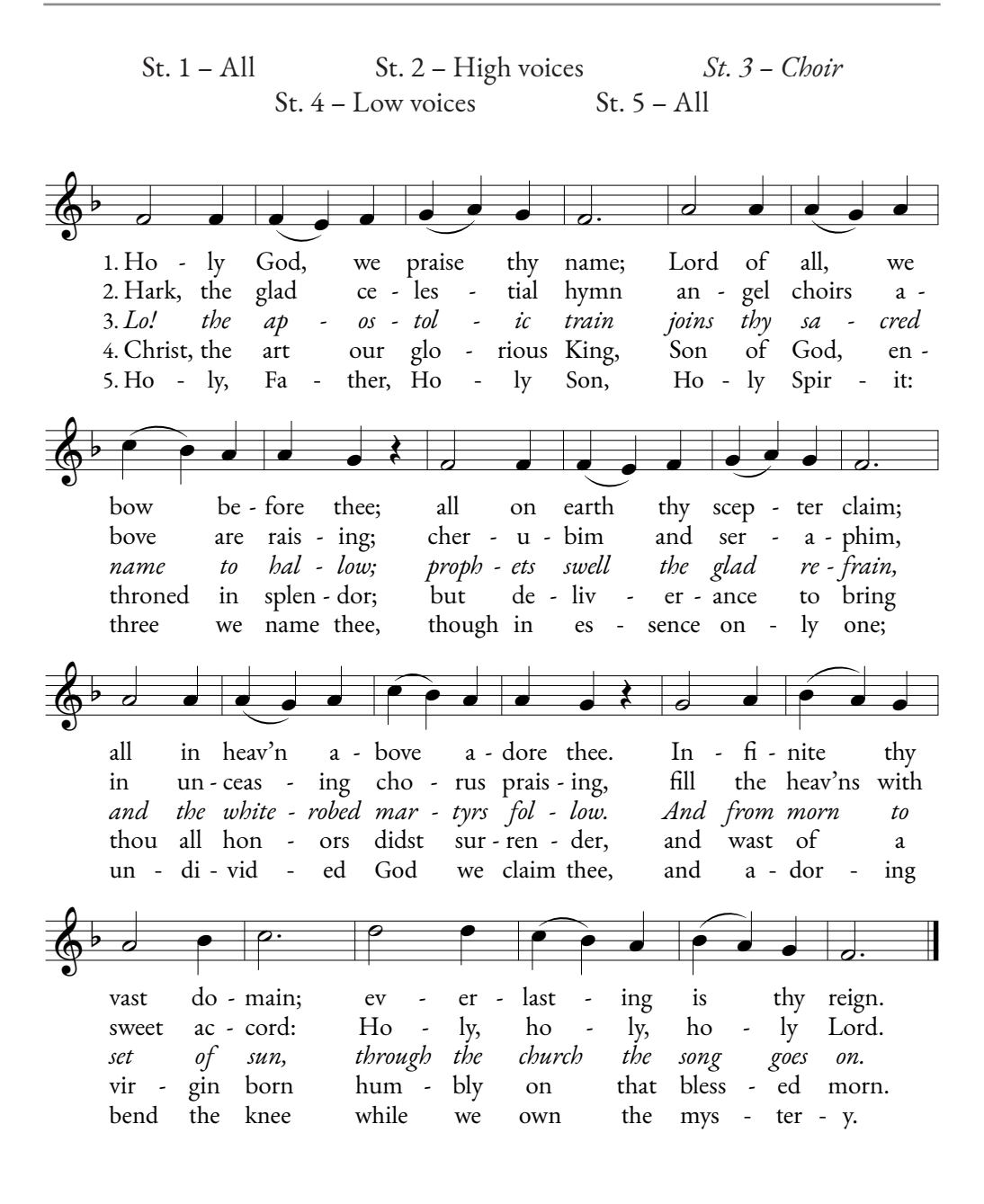
Text: sts. 1–3, 5, paraphrase of the Te Deum laudamus , attr. Ignaz Franz (1719–1790), trans. Clarence A. Walworth (1820–1900); st. 4, Francis Bland Tucker (1895–1984), © 1985 The Church Pension Fund. Music: GROSSER GOTT: Katholisches Gesangbuch , Vienna, 1774.