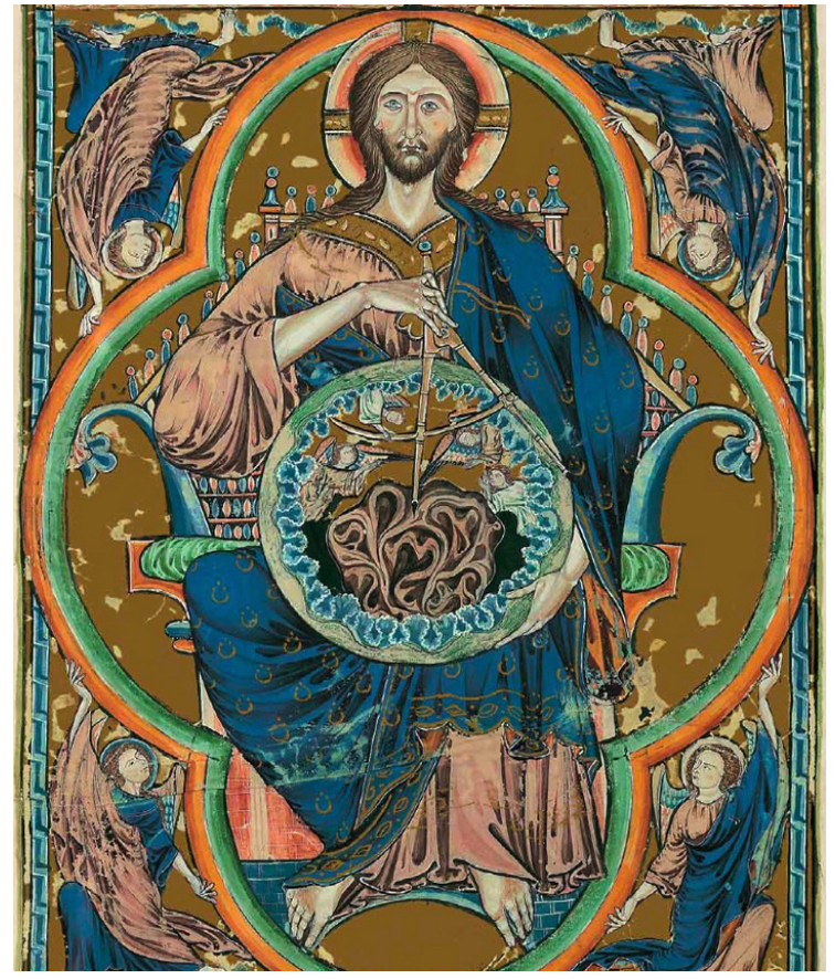
Artist unknown, The Pantocrator, God the Son, from The Bible of St. Louis, ca. 1226.

Christ the King Sunday Sunday, November 20, 2022, 11:00 a.m.