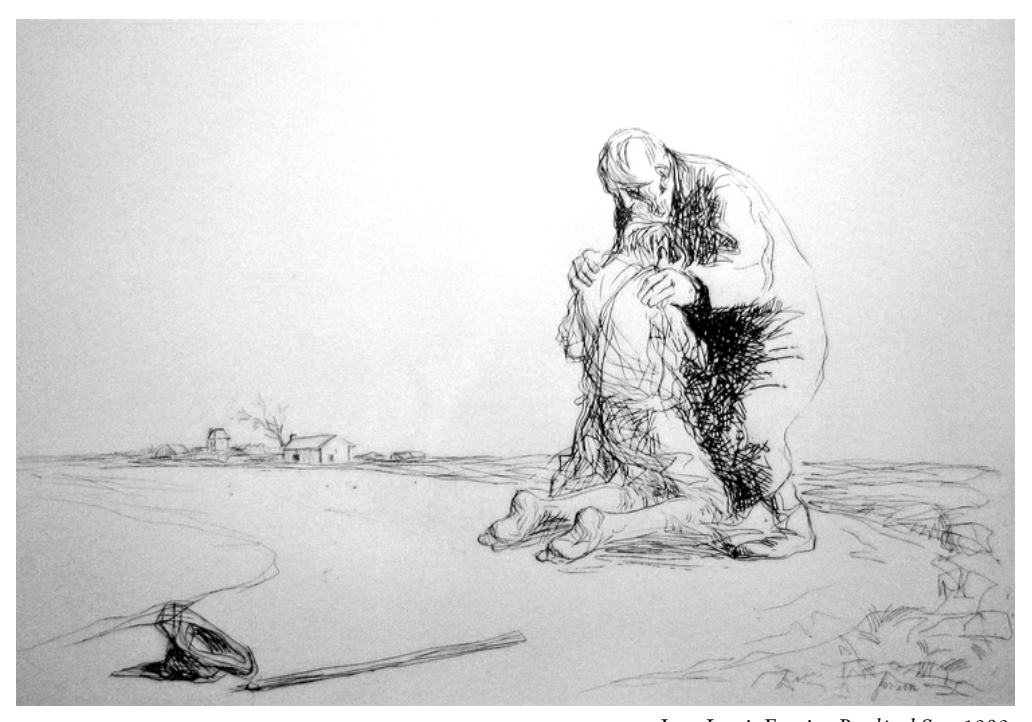
Jean Louis Forain, Prodigal Son, 1909.

Fourth Sunday in Lent Sunday, March 27, 2022, 11:00 a.m.