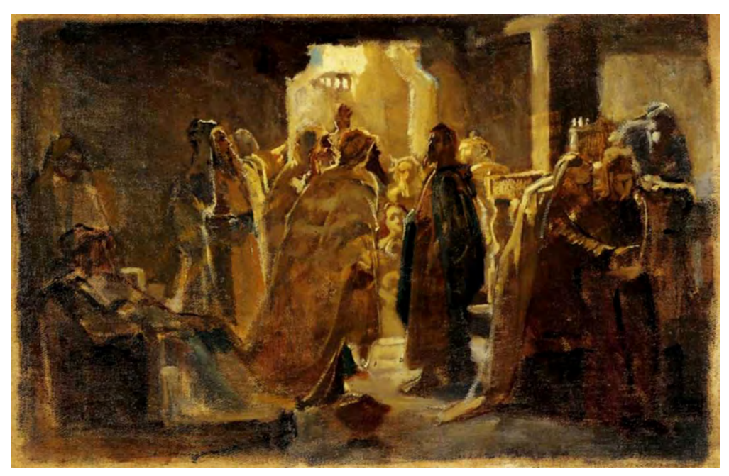
Nikolaĭ Nikolaevich Ge, Christ in the Synagogue, 1868.

Fourth Sunday after Epiphany Sunday, January 30, 2022, 11:00 a.m.