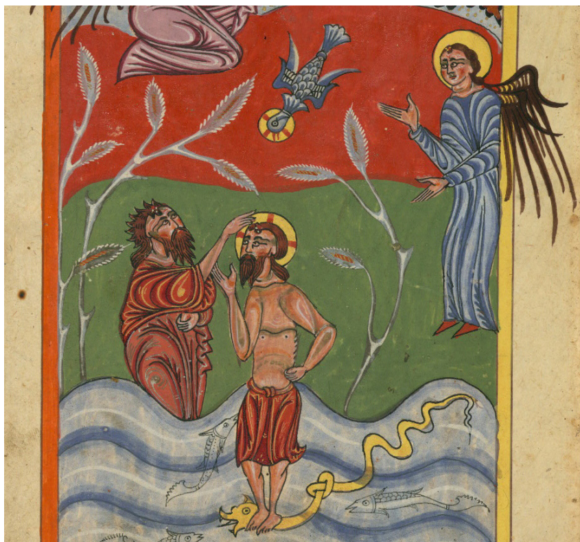
Baptism of Christ