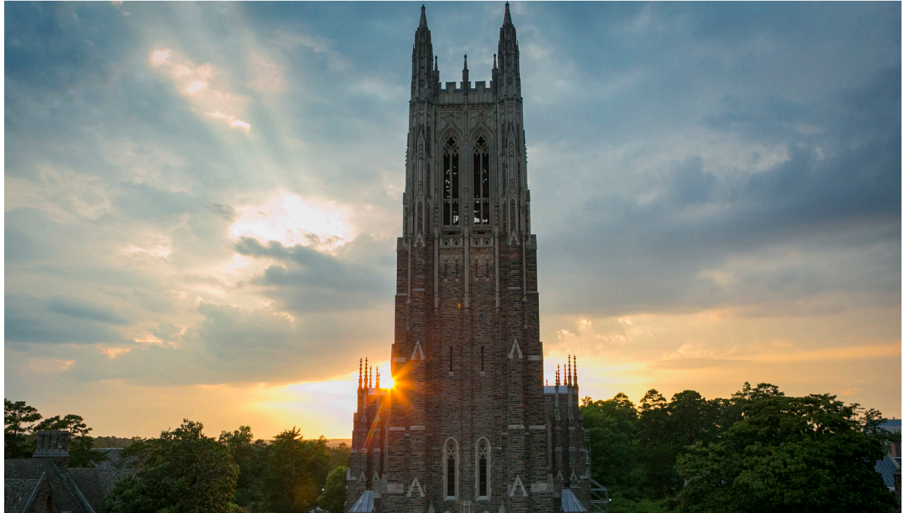
Chapel at Sunset

Eighth Sunday After Pentecost Sunday, July 26, 2020, 11:00 a.m.