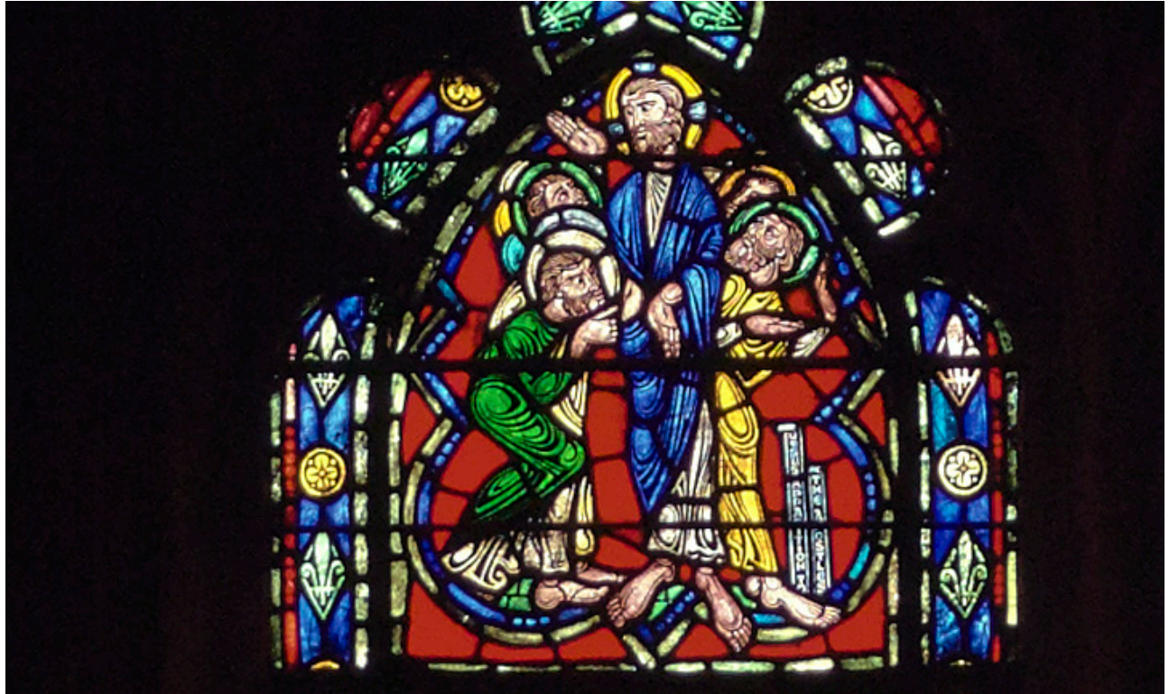
Jesus Appears to the Disciples Stained Glass Window in Duke University Chapel

Second Sunday of Easter Sunday, April 19, 2020, 11:00 a.m.