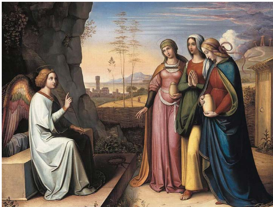
The Three Marys at the Tomb Peter von Cornelius, c. 1815

Easter Sunday is the principal feast of the liturgical year—the day Christians celebrate Jesus’ resurrection from the dead on the third day after his crucifixion. The resurrection of Christ has been a focal point of Christian confession since the early church; Christians have understood the resurrection to be the central witness of God’s radical action in human history. Jesus, God incarnate, went to the depths of the earth and overcame the power of death that we might have life eternal.