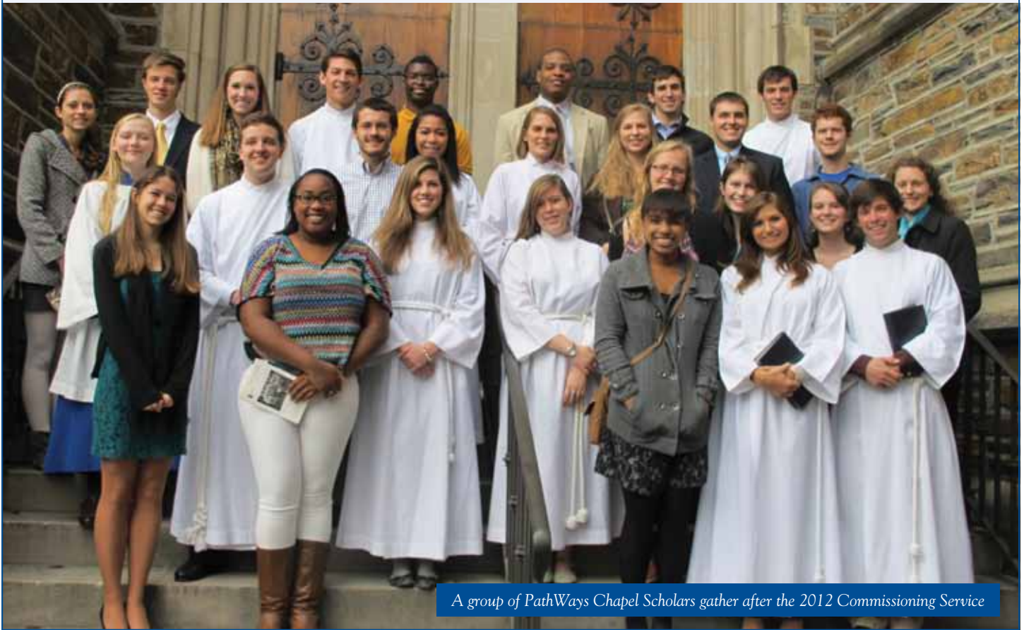
A group of PathWays Chapel Scholars gather after the 2012 Commissioning Service

Gifts from Friends of Duke Chapel made in FY 2012 (July 1, 2011 to June 30, 2012). We have made every effort to list donors correctly. If we have made an error with your name or giving level, please contact Chapel Development at (919) 684-5955 or chapeldevelopment@duke.edu.