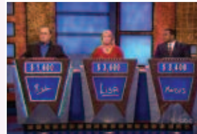
All three contestants on a recent episode of JEOPARDY! were stumped by a clue about Duke Chapel.

Duke Chapel and the Canterbury Cathedral are not, however, exactly alike, Bruzelius said. Their towers are at different places – the cathedral's is at the center and the chapel's is integrated into the entrance.