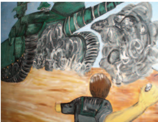
Mural at refugee camp.