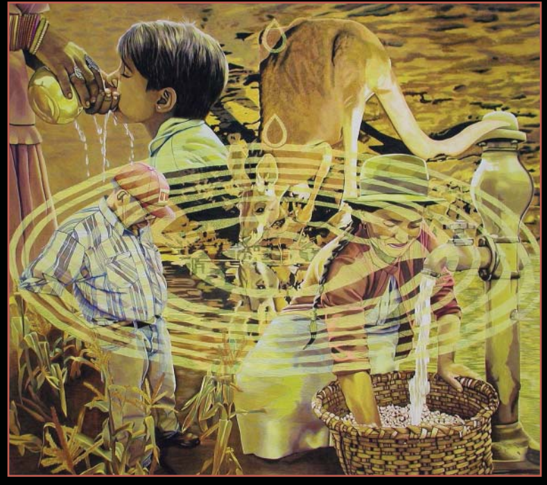
"Precious Water", textile art by Hollis Chatelain

The Hope for Our World exhibit of textile art will be hung in the Chapel on March 30, 2008, and will remain for two weeks, through Sunday, April 13, 2008. The exhibit will include 10 pieces, each "flying" from the arches in the nave. Dean Wells wants to encourage the use of the Chapel for exhibiting art that challenges us to strive for justice in the world, and each piece in the exhibit does just that. Two of the pieces in the exhibit have just won top prizes at the largest international quilt show in the world, including the signature piece, a depiction of Desmond Tutu with children from around the world, which was judged Best of Show. At right, you will find a photograph of another Best of