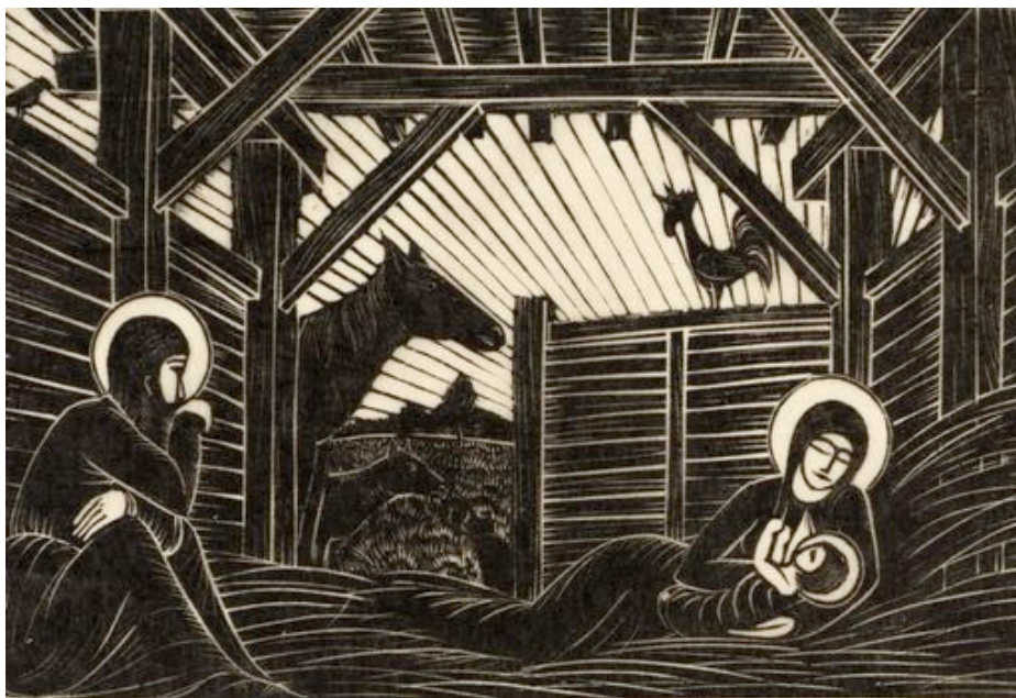
"Dawn," by Eric Gill, 1929.

≈ Keeping the heart of the University listening to the heart of God ≈