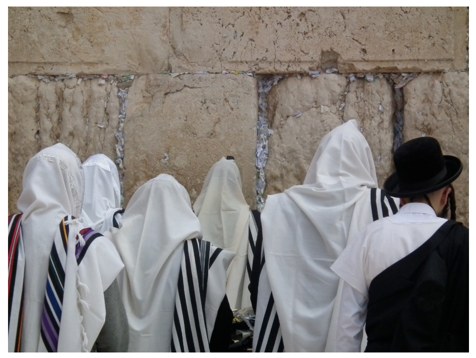
People praying at the western wall, the ancient remnant that surrounded the Jewish Temple in antiquity.

\approx Keeping the heart of the University listening to the heart of God \ll