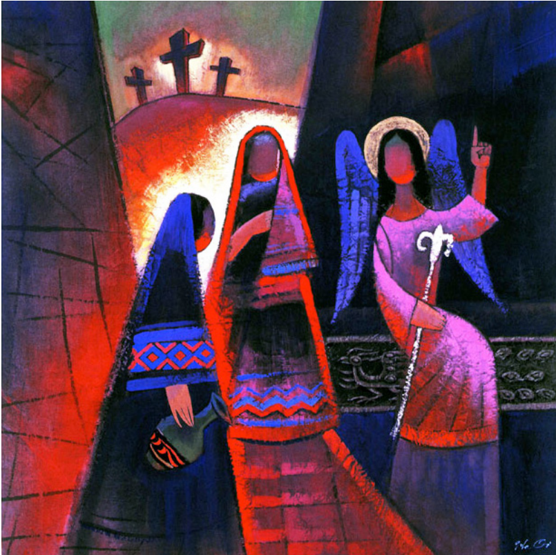
"He Is Risen (A)," by He Qi, 2001. www.heqiarts.com .

~ Keeping the heart of the University listening to the heart of God ~